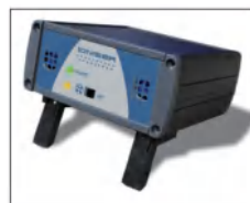
Option: static eliminator