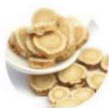
Chinese Medicine 7-15%