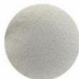
Stone Power 0.4-0.5%